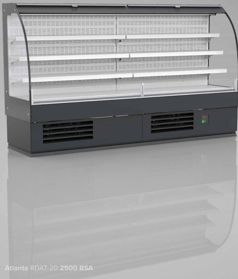
Atlanta RDAT-20 2500 BSA

BSA — low glass or front glass riser | single, straight | fixed